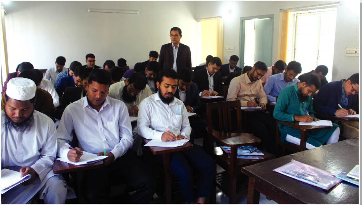
Training Class at WZPDC Training Institute.