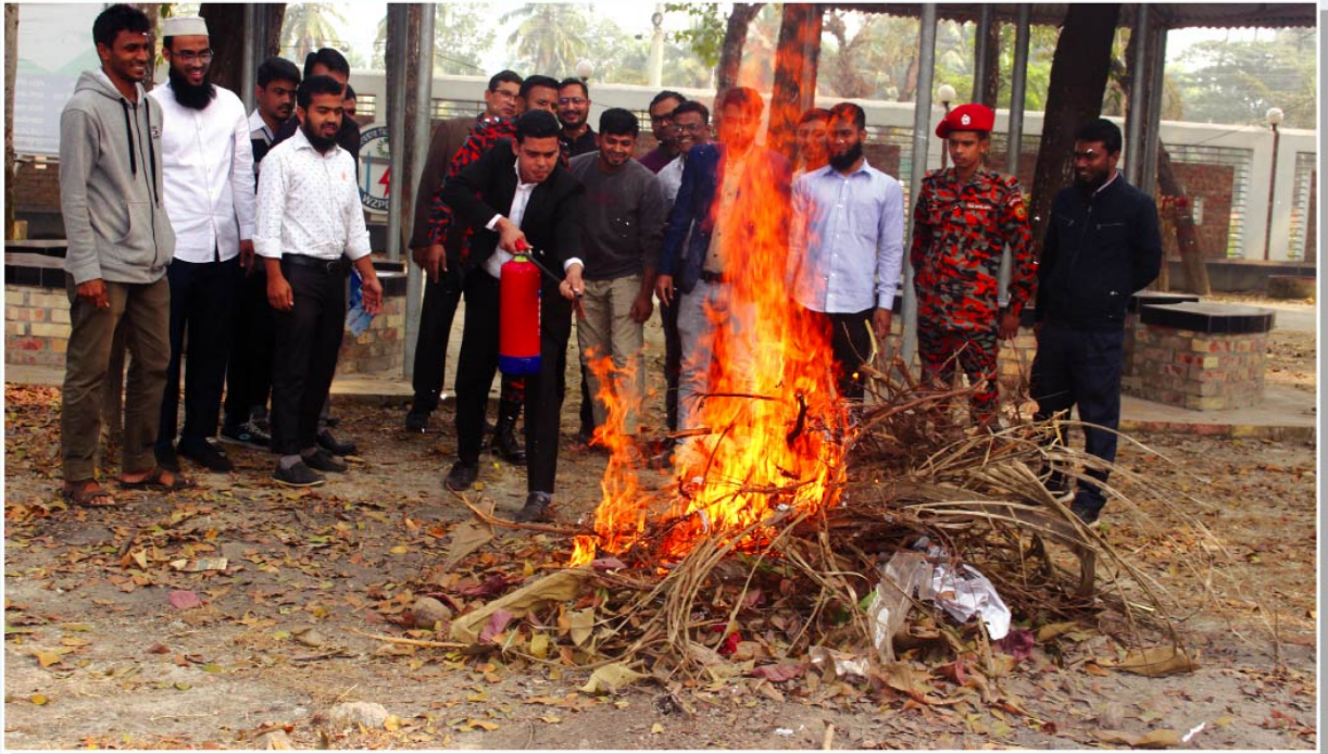
Practical Training on Fire fighting.