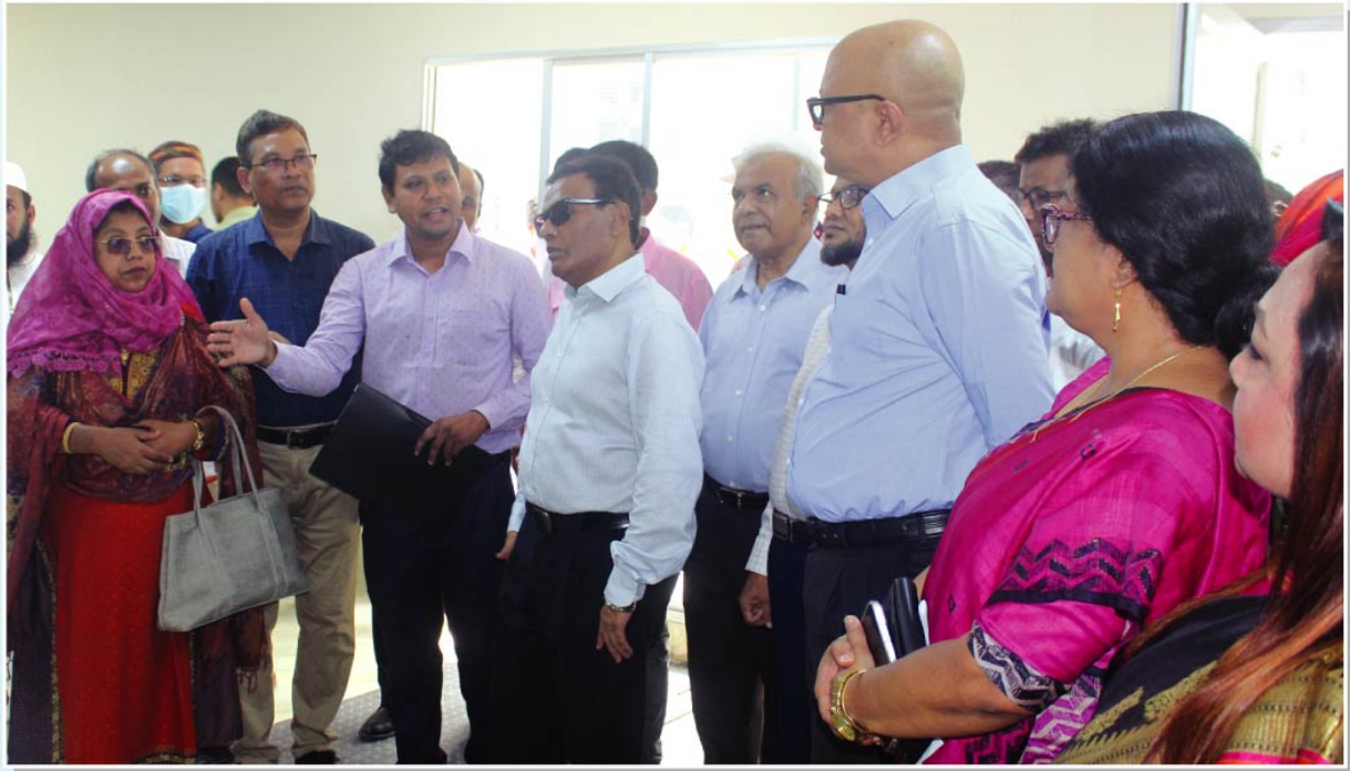
Honorable Secretary, Power Division visited Model Sub-station at WZPDC Training Institute.