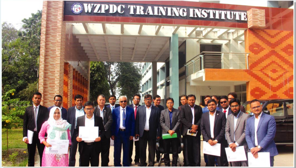
Photo Session of newly appointed Officers after Foundation Training.