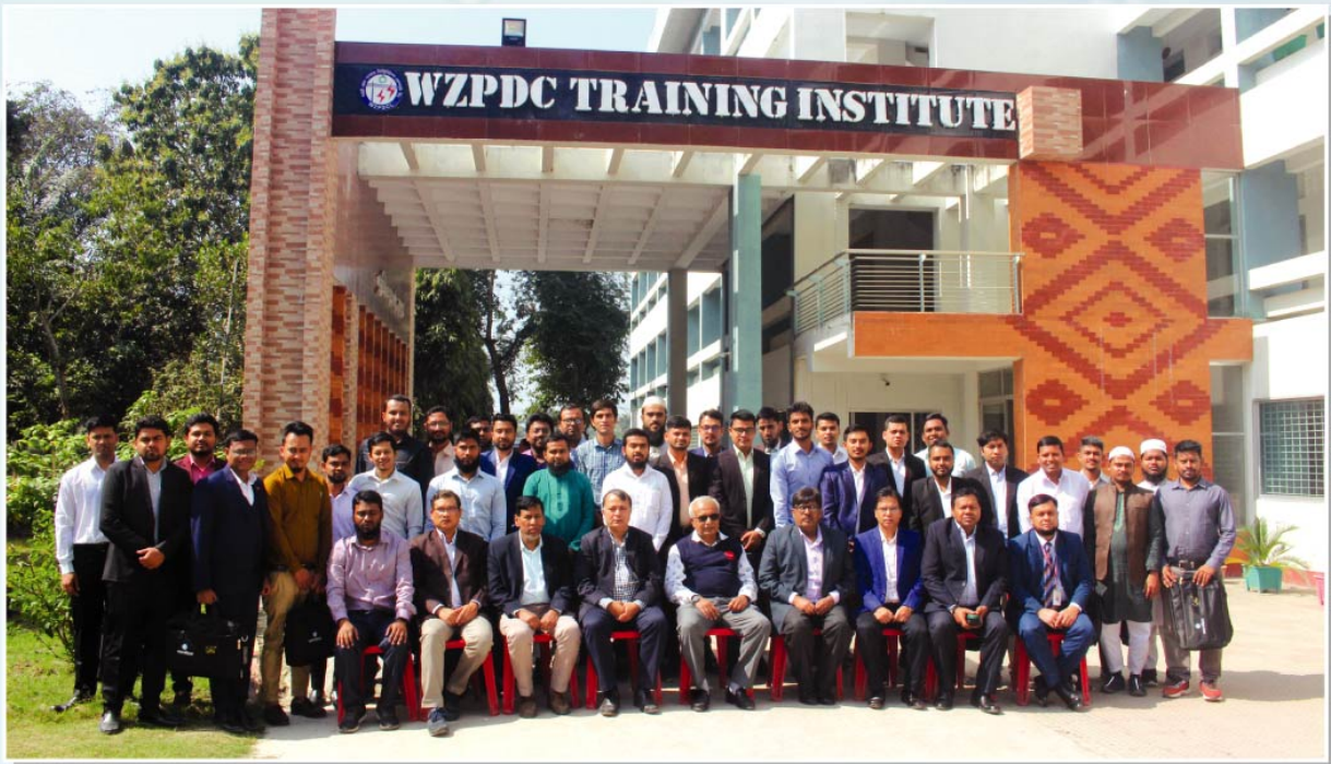
Photo Session of newly appointed SBA after Foundation Training.