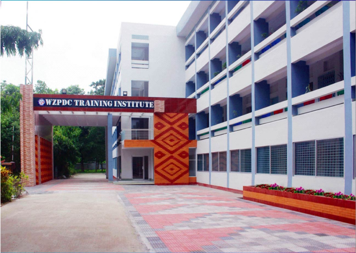
WZPDC Training Institute, WZPDCL, Khulna.