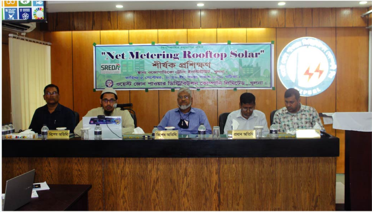
Workshop on Net metering Rooftop Solar conducting by SREDA, Power Division