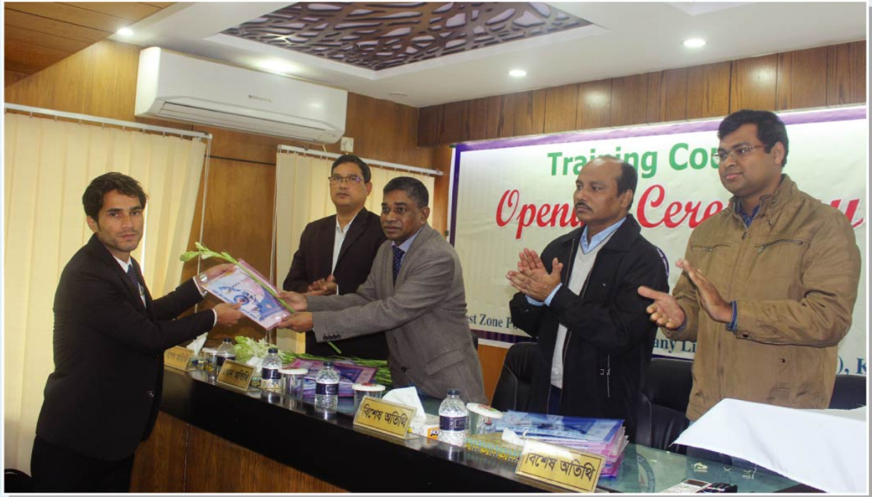
Trainee receiving Training materials from Chief Engineer (ESCS), WZPDCL, Khulna.