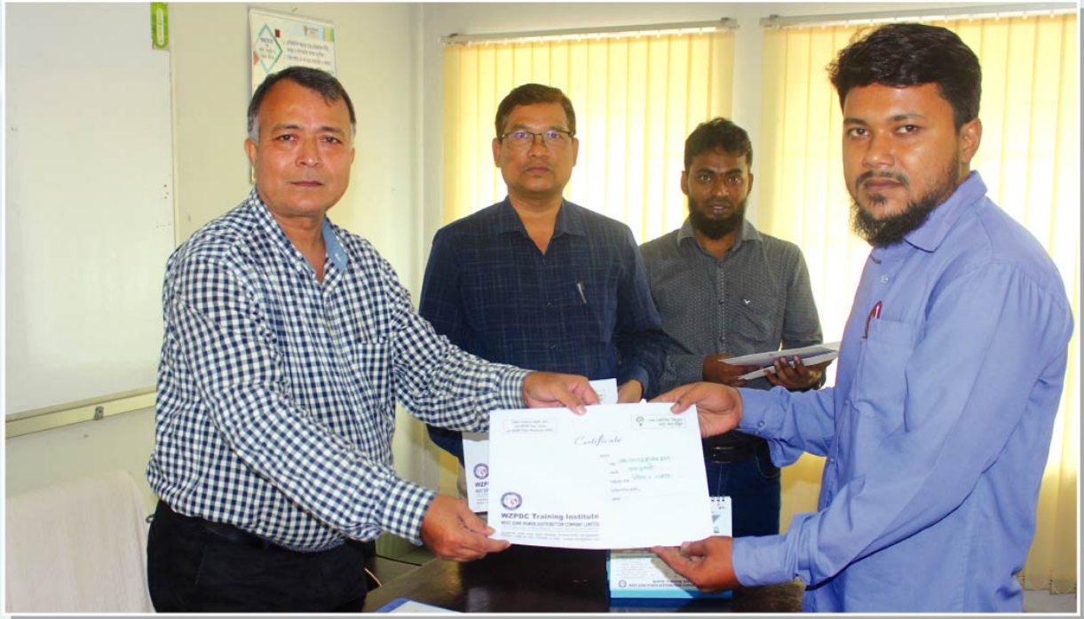
Trainee receiving Certificate from Executive Director (Finance), WZPDCL, Khulna.