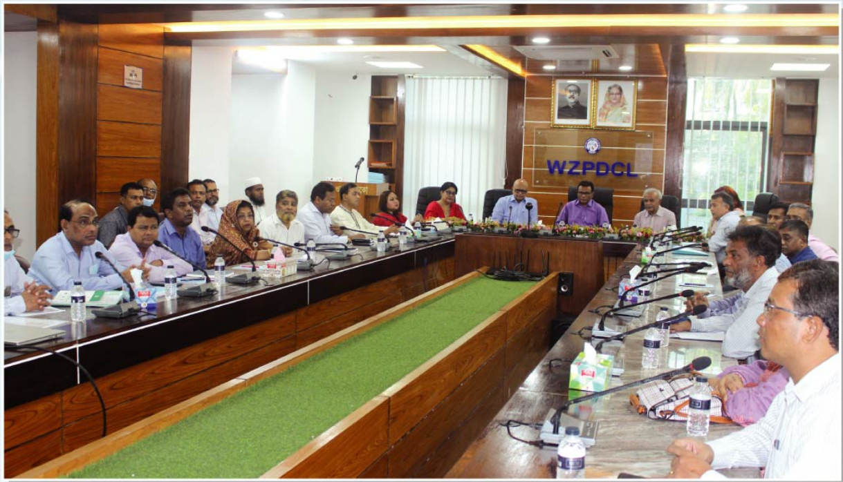
General Meeting in Presence of Honorable Secretary, Power Division & Chairman, WZPDCL.