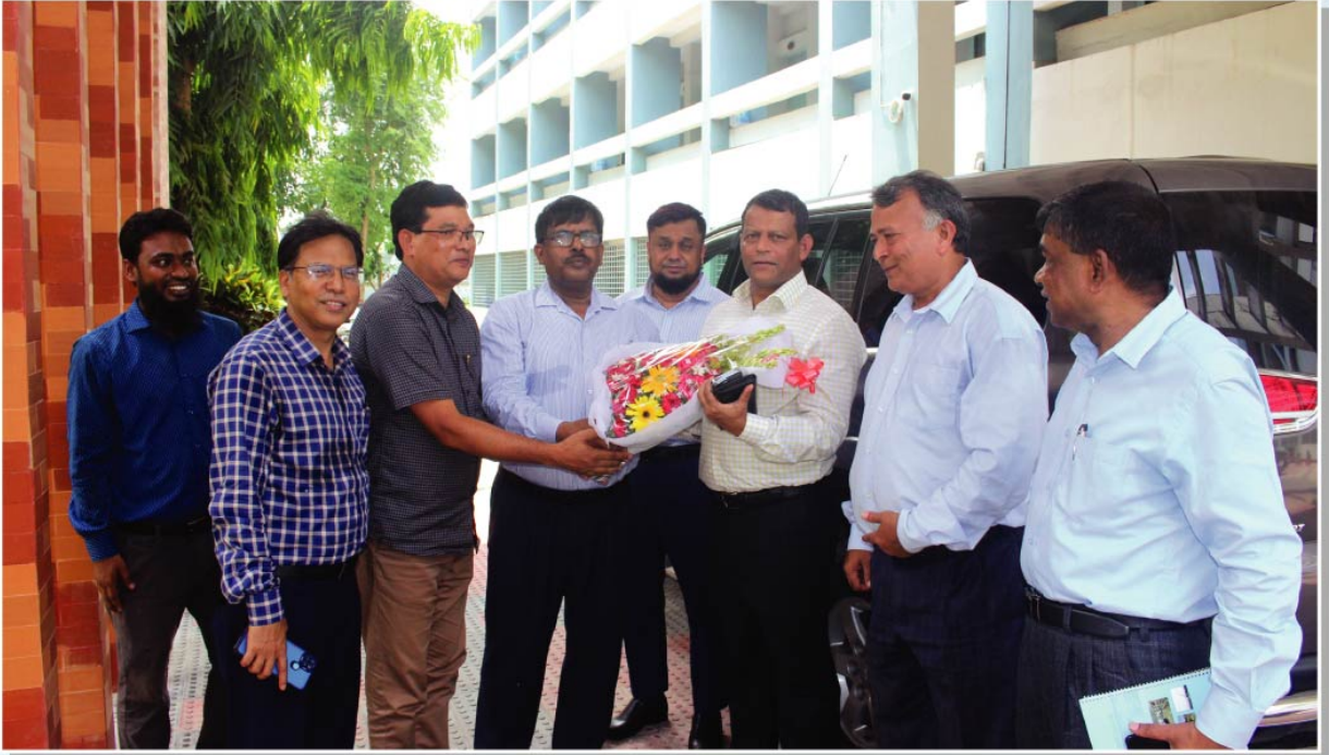
Welcome greeting to newly joined Managing Director at WZPDC Training Institute.