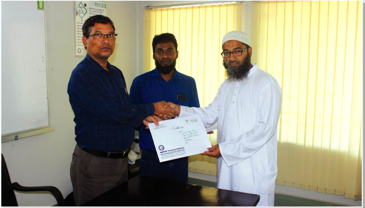
Trainee receiving Certificate from Executive Engineer, WZPDC Training Institute, Khulna.