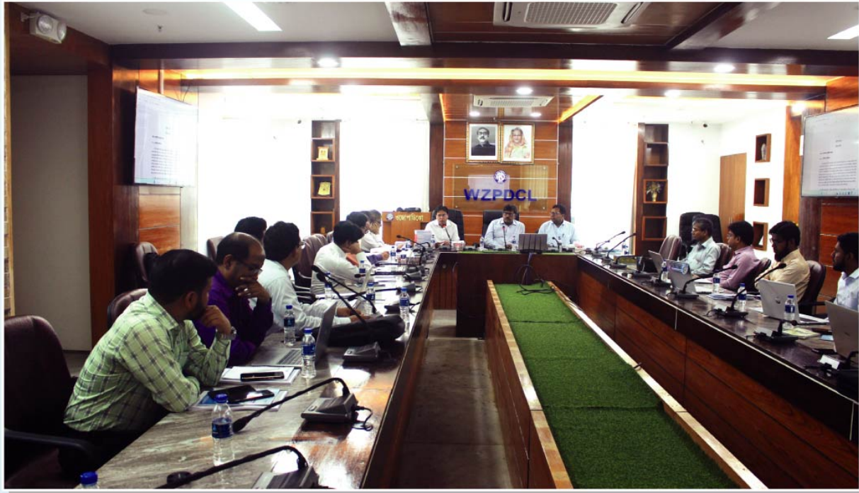
Workshop on Nothy System conducting by DGM, HR & Admin, WZPDCL, Khulna.