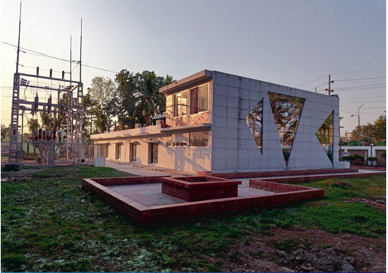
Model Sub-station, WZPDC training Institute